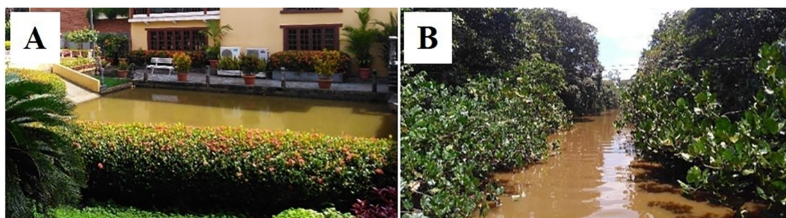
Figure 2 - Sections of the Tucunduba River; A) Source of the Tucunduba river inside private property and B) Mouth of the Tucunduba river.

This basin drains four peripheral districts of the city: Marco, Canudos, Terra Firme, and Guamá. According to the IBGE (2010), Belém has approximately 1,393,399 inhabitants, with three of the ten most populous neighborhoods in the city located in the Tucunduba basin area, namely: Guamá (94,610 inhabitants – 25,703 households), Marco (65,844 inhabitants – 20,212 households), and Terra Firme (61,439 inhabitants – 16,439 households).