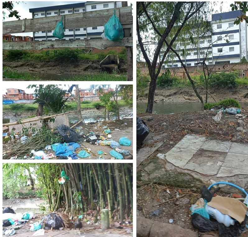
Figure 4 - Photos depicting the disposal of waste on the margins of the Tucunduba River in Section 1 of Stage 1.

material damages are also significant, with the destruction of buildings, vehicles, furniture, and household items, loss of perishable food, traffic obstruction, and even interruptions in energy service.