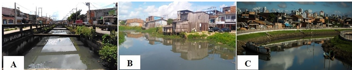
Figure 3 - Sections of the Tucunduba River A) Cipriano Santos Canal, Canudos neighborhood. B) Avenue Celso Malcher, Terra Firme neighborhood 2018. C) Passagem Tucunduba, Guamá neighborhood.

Along the basin, each neighborhood has unique characteristics shaped by urban interventions that modify the landscape and land uses, as illustrated in Figure 3A for the well-known Cipriano Santos Canal in the Canudos neighborhood, Figure 3B for Avenue Celso Malcher in the Terra Firme neighborhood, and Figure 3C for Passagem Tucunduba in the Guamá neighborhood. These figures show the neighborhoods at distinct stages /of development.