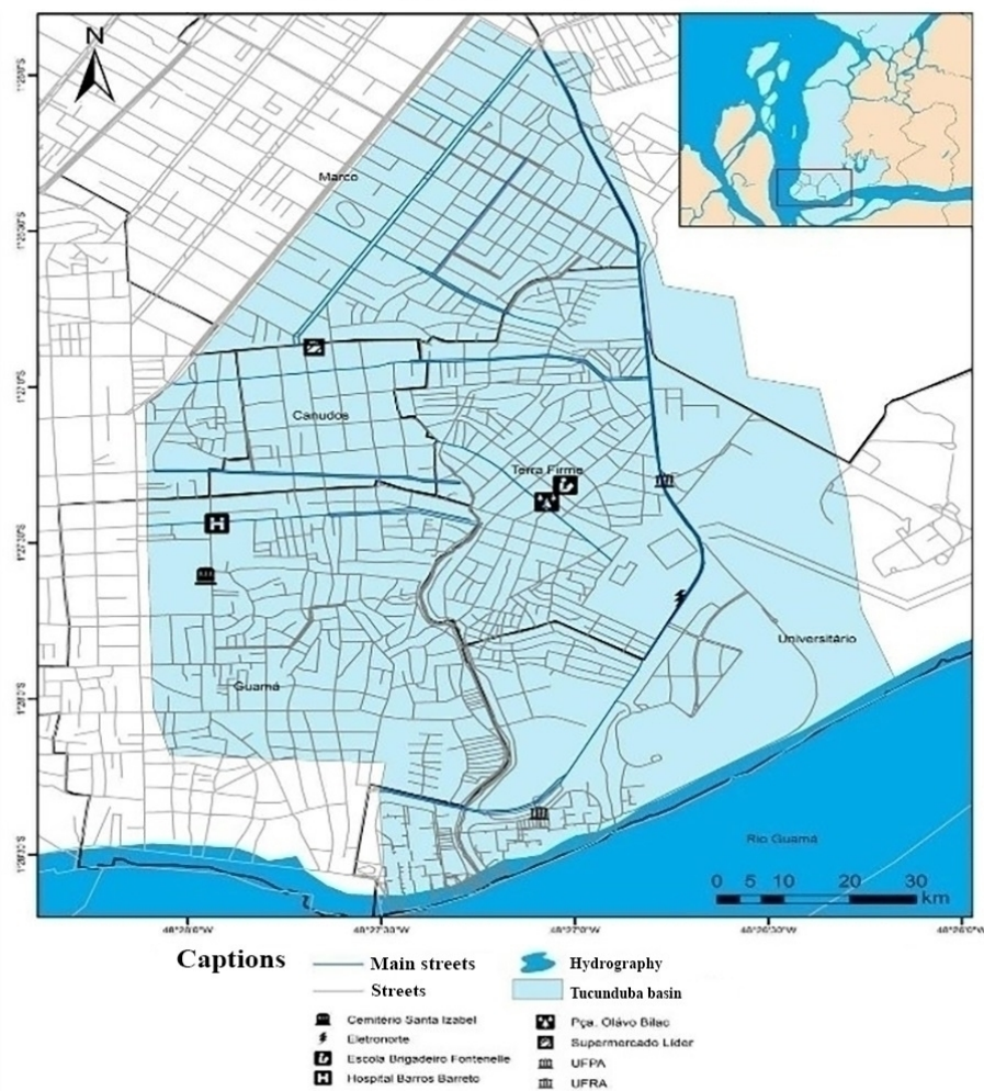
Figure 1 - Map of the Tucunduba River Basin.

This basin drains four peripheral districts of the city: Marco, Canudos, Terra Firme, and Guamá. According to the IBGE (2010), Belém has approximately 1,393,399 inhabitants, with three of the ten most populous neighborhoods in the city located in the Tucunduba basin area, namely: Guamá (94,610 inhabitants – 25,703 households), Marco (65,844 inhabitants – 20,212 households), and Terra Firme (61,439 inhabitants – 16,439 households).