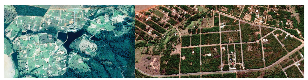
Figure 3 - Condominiums Águas das Serra, in Hidrolândia, and Águas da Serra, in Villa Verde

found in most condominiums, are closely related to leisure because country leisure cannot spare urban commodities. In this regard, there are few differences between these establishments and their urban counterparts, with the exception of sewage collection and streamflow. Septic tanks with sumps is the most common system used, whereas pluvial drainage via combined sewers is less common. The costs of sewer systems, as well as of asphalt or other pavement materials, are higher than investments in energy and water networks. The latter is a central element in commercial marketing. Small streams or dams can be found in 26 of the condominiums investigated. Associating leisure and water is nothing more than an element feigned by the landscape, given that these areas are rarely used as spaces for collective use.