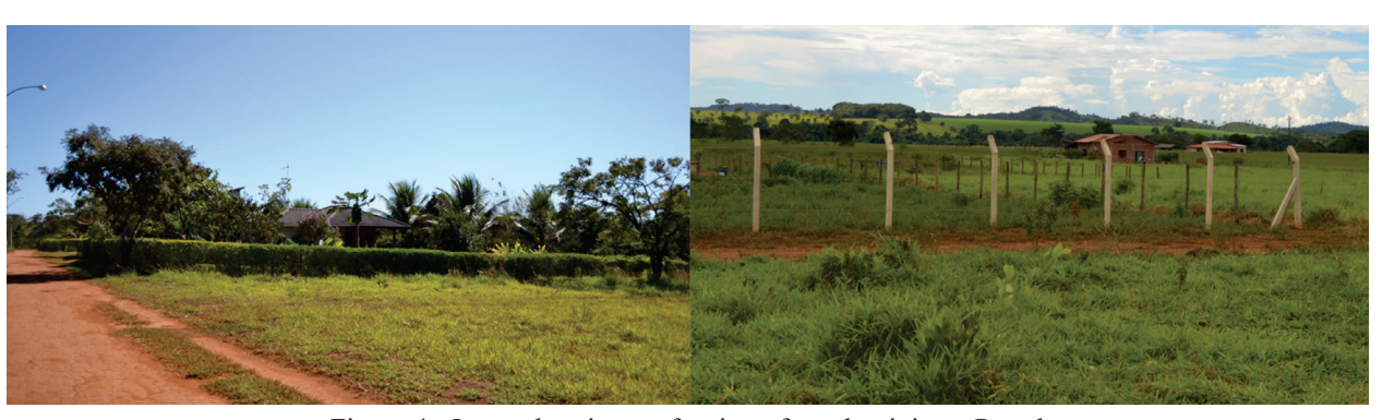
Figure 4 - Internal perimeter fencing of condominiums Portal do Cerrado, in Bela Vista de Goiás, and Portal dos Ventos, in Trindade Images: The author (2015).

Activities are normally restricted to gardening, tending vegetable patches (less common) and a kind of receptive leisure, expressed by welcoming relatives and friends on weekends. Property owners frequently refer to their country houses as 'a place to welcome friends'. In a condominium located in Bela Vista de Goiás, one owner reported her habit of 'making pamonha for friends and relatives.' These activities are normally carried out by owners themselves. Even though the present study did not establish their socio-occupational profile, field observations revealed a majority of liberal professionals and retired individuals. A certain degree of nostalgia was well illustrated by a country house owner in Teresópolis de Goiás, who lives in Brasília but only awaits retirement to 'set in' in order to move to the country for good.