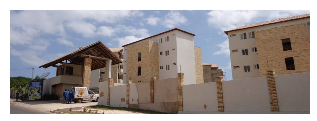
Figure 3 - Vertical condominium in Tibau-RN Author: Iara Rafaela Gomes

Secondary residences materialize this process and it is through their use that vacationers expand their living spaces because even if this activity involves the opportunities for many leisure pursuits, the practice of vacationing certainly involves the sense of habitation and all its ties. For this reason, amid those expounded above, we consider it quite relevant to discuss the relationship between the spread of the modern maritime practice of maritime vacationing and its relations with the urbanization process. We also highlight our interest in studying the processes that occur beyond the metropolitan scale.