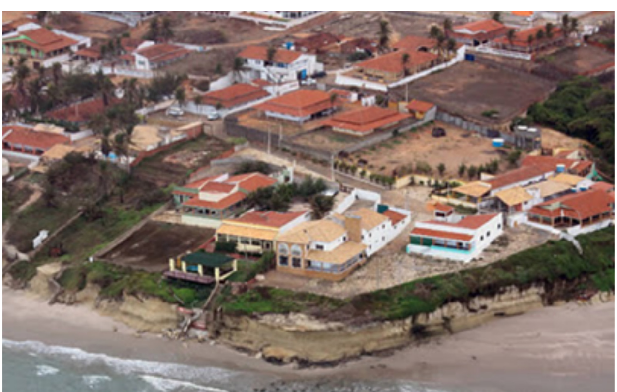
Figure 4 - Homogeneous cluster in Tibau-RN Source: http://www.tibau.blogspot.com.br/p/tibau.html (Accessed June 12, 2012). Author: Raul Pereira.

Secondary residences materialize this process and it is through their use that vacationers expand their living spaces because even if this activity involves the opportunities for many leisure pursuits, the practice of vacationing certainly involves the sense of habitation and all its ties. For this reason, amid those expounded above, we consider it quite relevant to discuss the relationship between the spread of the modern maritime practice of maritime vacationing and its relations with the urbanization process. We also highlight our interest in studying the processes that occur beyond the metropolitan scale.