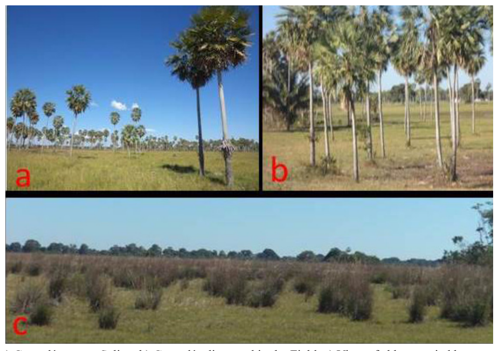
Figure 6 - a) Carandás near a Salina, b) Carandás dispersed in the Field, c) View of ebb occupied by vegetation cited by pantaneiro Luis.