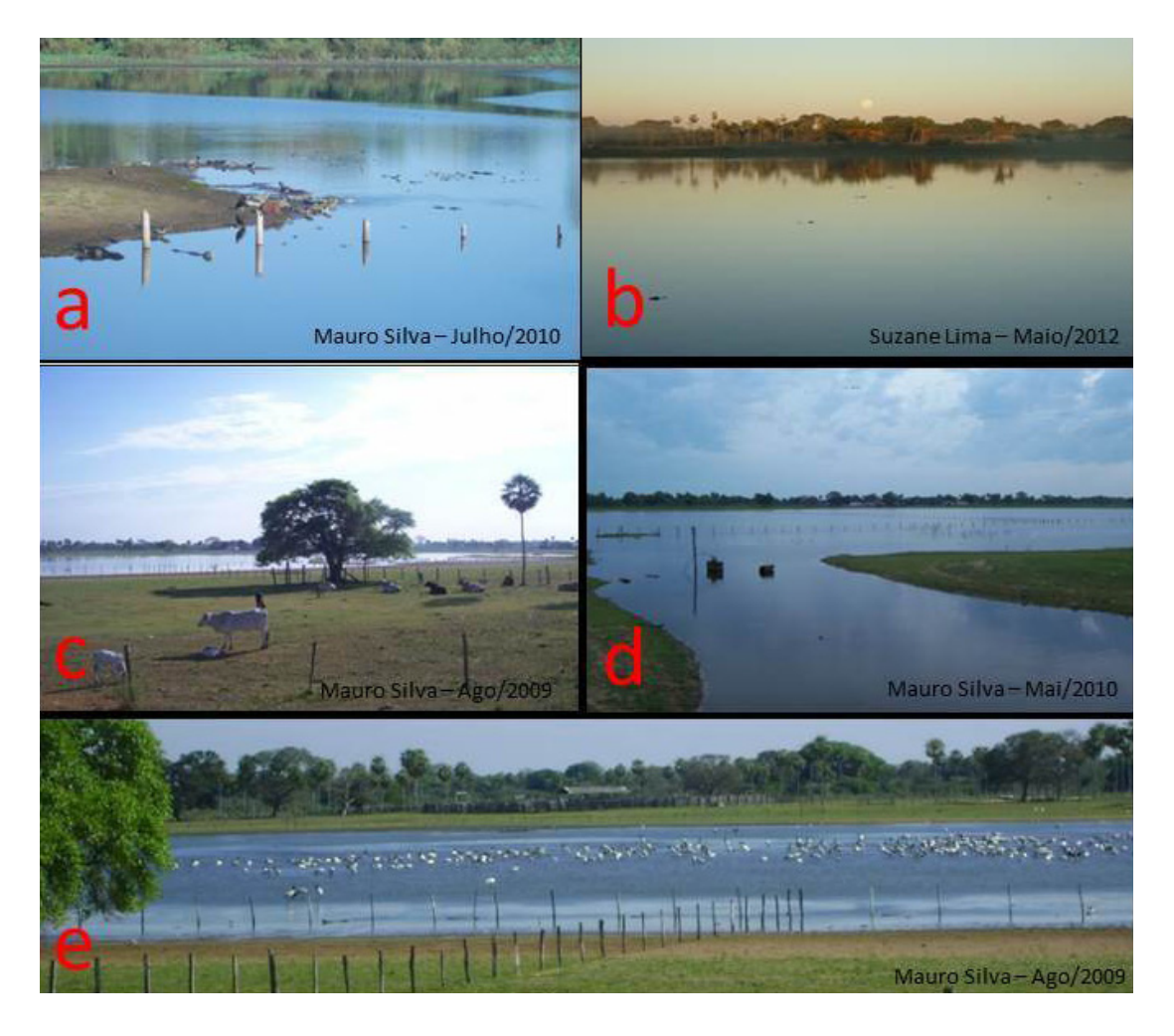
Figure 5 - a and b) Bays of the Pantanal of Nhecolândia; c, d, e) Large bay evidenced specifically by the interviewee Augusto S.