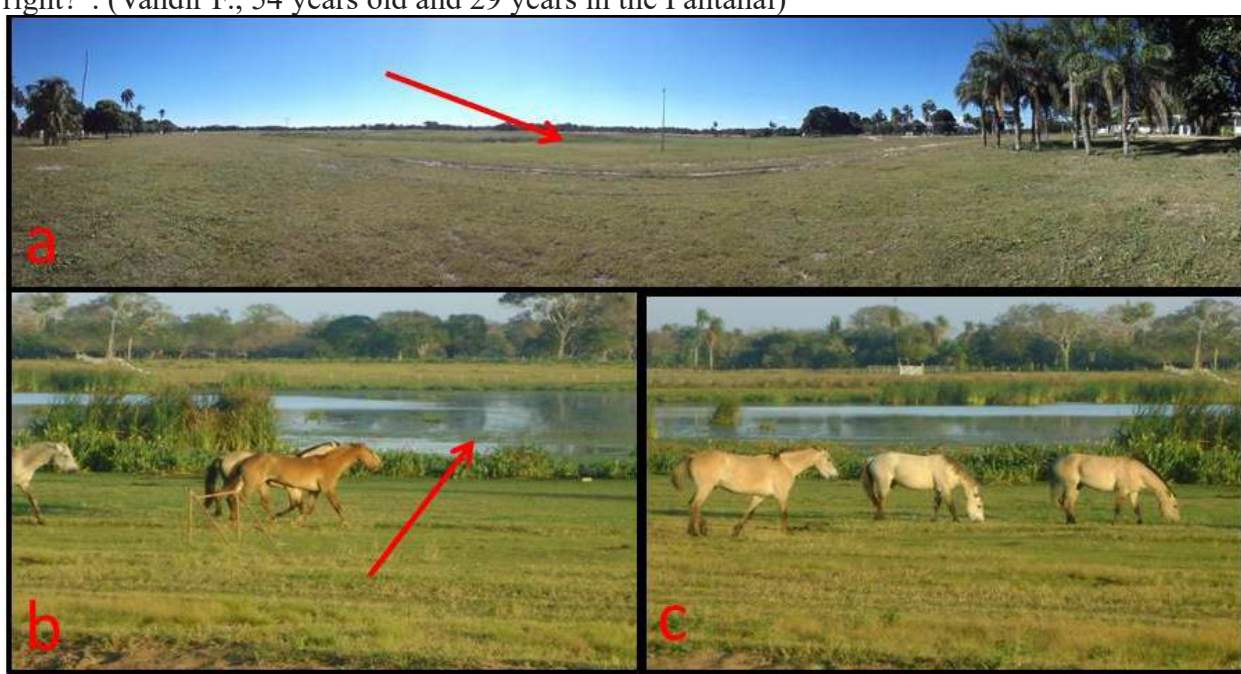
Figure 4 - Bay cited by Seu Armindo and Seu Vandir. a) with little water and large amount of grass and invasive vegetation in August 2012 (Photo: Mauro Silva); b) full in May 2009, (Photo: Suzane Lima).

right?". (Vandir F., 54 years old and 29 years in the Pantanal)