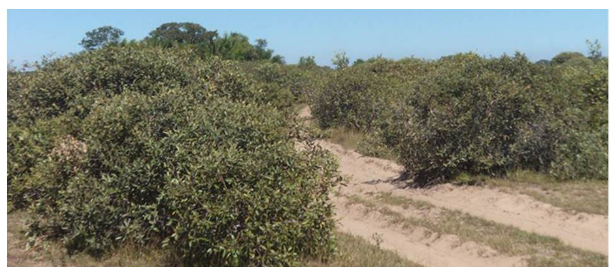
Figure 3 - Invasive shrub vegetation that expands through the Campos areas. (Photo.: Mauro Silva - May/2012).

Another type of change observed refers to the invasive shrub vegetation (Figure 3), which according to the statements is mainly occupying areas of bays and fields with greater frequency and intensity in recent years, according to them, due to prolonged droughts in the last decade. "The scenery changed, changed a lot, changed a lot. [...] You could walk for miles and miles without seeing a bush, only countryside and the bay. This bay here in the old days you couldn't see all this stuff that there is now. Look at it now! ... they are all like this [...] the drought brings a lot of dirt." (Armindo S., 61 years old and 23 years in the Pantanal).