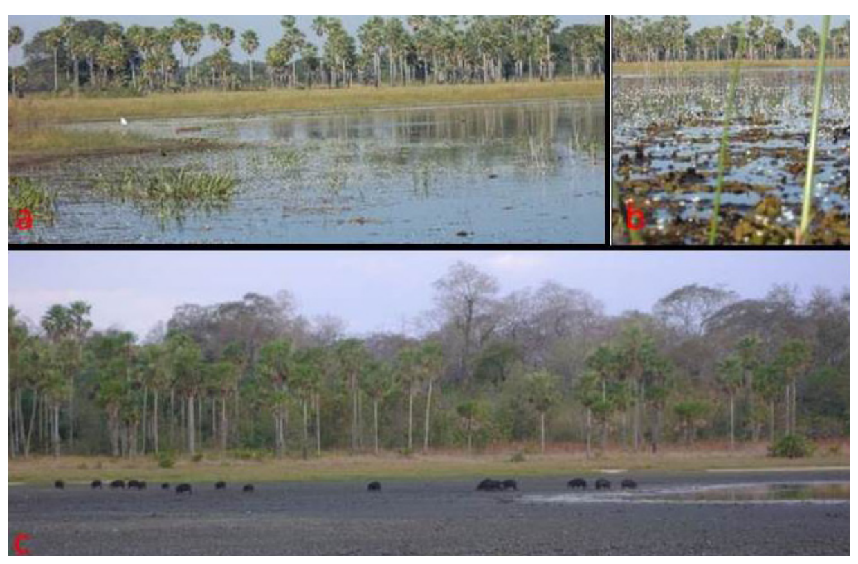
Figure 8 - a, b) Salitrada with animals and macrophyte vegetation rarely found in salinas - photo: Mauro Silva, May / 2012. c) Salitrada Lagoon Dora Field used as a refuge for intake of water in dry season- photo: M.Silva, Aug/2009.

The salitrada is almost a saltmarsh, when it has enough water it is different, there is a type of vegetation that does not occur in the salina, more animals get in (Figure 8), now when it starts to dry it gets thick, saltier. I think the name salitrada, as the old pantaneiros said, passing from one to the other, here we don't say lagoon, only salina, bay and salitrada. (Quequé, 61 years old and 20 years in the Pantanal)