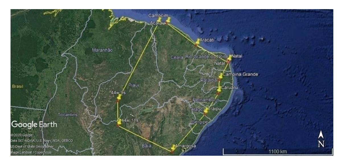
Figure 1 - The drought polygon based on the 1934 Federal Constitution.

Although the search for an official Geography and the fight against drought had always permeated rich discussions in the Old Republic<sup>9</sup>, these concepts would only be structured in President Getúlio Vargas' administration. The 1934 Federal Constitution was the first to raise concerns about combating drought and in art.177 it provided that the Union should protect the northern states. The legislation<sup>10</sup> defined a polygonal area, as shown below. <sup>11</sup>