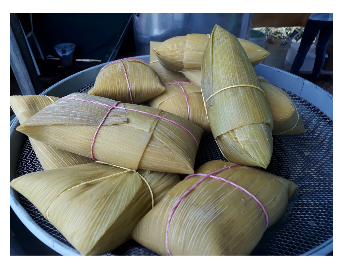
Figure 4 - Pamonhas ready for purchase or consumption. Fieldwork. Setor Pedro Ludovico's Street Market, Mar. 2020.