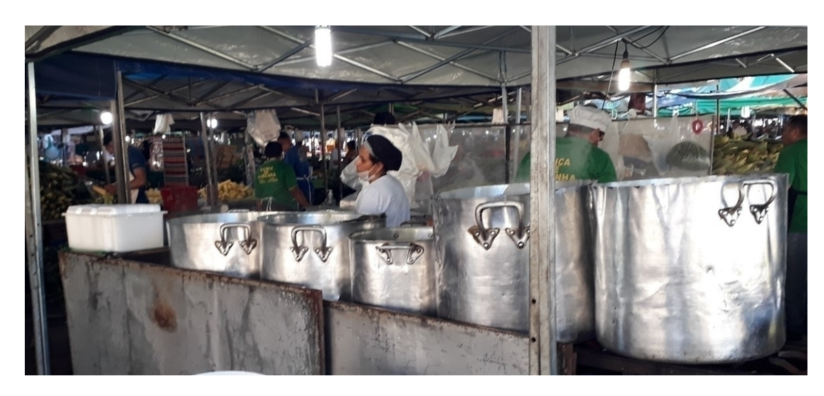
Figure 2 - Pamonha Production at Setor Coimbra's Street Market, Goiânia, 2019. Fieldwork. Setor Coimbra's Street Market, Oct. 2019.

Corn husks are previously cooked in caldrons in order to not break when the dough is inserted in the husk 'cup' made by the women. This traditional packaging is found in various Brazilian states in the southeastern, center-west and northwestern regions. In a sequential manner, women include fresh cheese strips and ready-dough in the husk dough then tie the package with rubber bands. The color of the bands differentiates sweet and salty ones. The rubber bands are also previously cooked in order to not interfere in the taste. Pamonhas are then putted into aluminum pans with fervent water to cook during 40 to 60 minutes (Figure 3).