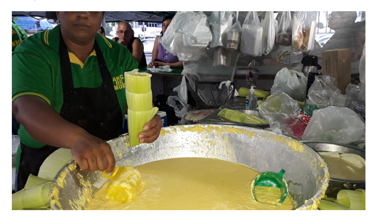
Figure 3 – Insertion of pamonha dough into a husk cup, Goiânia, 2019. Fieldwork. Setor Coimbra's Street Market, Oct. 2019.

Corn husks are previously cooked in caldrons in order to not break when the dough is inserted in the husk 'cup' made by the women. This traditional packaging is found in various Brazilian states in the southeastern, center-west and northwestern regions. In a sequential manner, women include fresh cheese strips and ready-dough in the husk dough then tie the package with rubber bands. The color of the bands differentiates sweet and salty ones. The rubber bands are also previously cooked in order to not interfere in the taste. Pamonhas are then putted into aluminum pans with fervent water to cook during 40 to 60 minutes (Figure 3).