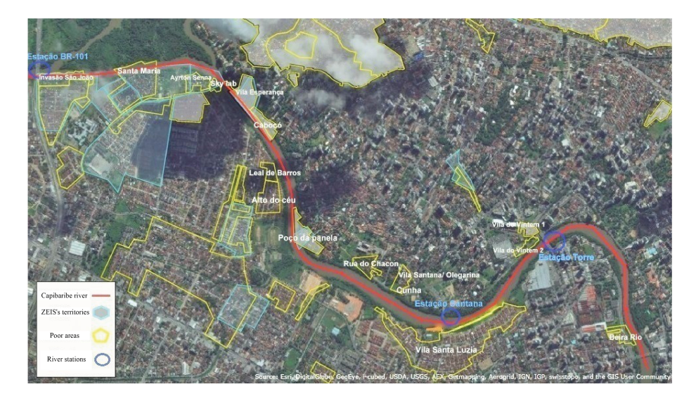
Figure 5 - Recife. Excerpt from the navigability project area of the Capibaribe.

It is worth reiterating that the idea of transforming Recife into a city-park and increasing the amount of public green areas by redeveloping the Capibaribe river as a structuring axis of the city is attractive and relevant to the current moment. The problem lies in the issue of who will be entitled to this substantial "public space." The official discourse masks that there are favelas and stilt-houses in the 500m radius calculated from each riverbank (Figure 5). In previous local urban experiences, such as that of the Beira Rio Avenue (Torre neighborhood), this low-income housing was entirely removed, a harbinger of things to come.