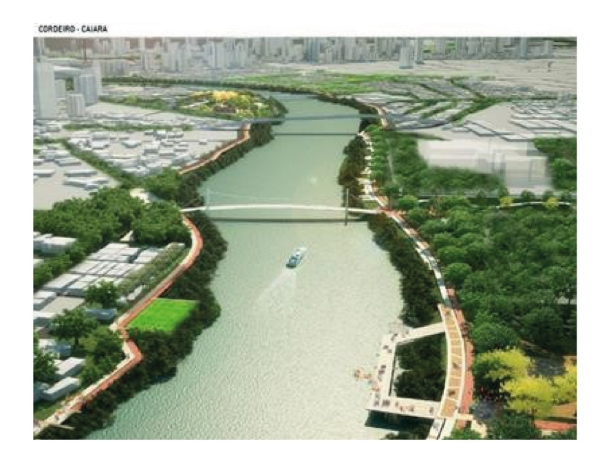
Figure 4 - Recife. PPC-CC maquette.

The maquette in Figure 4 is a three-dimensional image representing an imaginary view of the city according to the parameters of the CFREC's interests, superimposed on the territories historically used by the subordinate classes, which were intentionally "erased" in the model.