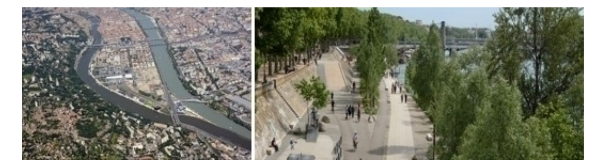
Figure 3 - Lyon. Urban Rehabilitation Project in La Confluence.

In Lyon, the area in the heart of the city known as La Confluence due to its location at the convergence of the Rhône and Saône rivers is no longer the center of predominantly port and industrial activities; currently, it is an area described as a "smart and durable city."