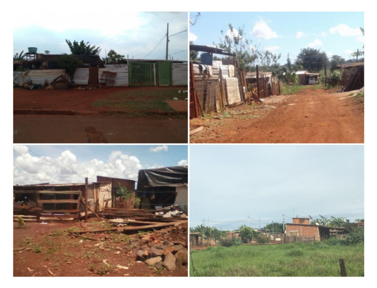
Figure 03 - Dourados-MS: Areas of intrusion.

Corroborating this picture, we highlight the occupation areas called "irregular", where the peripherization process is also revealed, which produces places clearly marked by precarious living conditions (Figure 03). In this perspective, as Sposito warns (2019a, p. 22), the socio-spatial condition of city dwellers directs "processes of separation that go beyond segregation and self-segregation to achieve socio-spatial fragmentation".