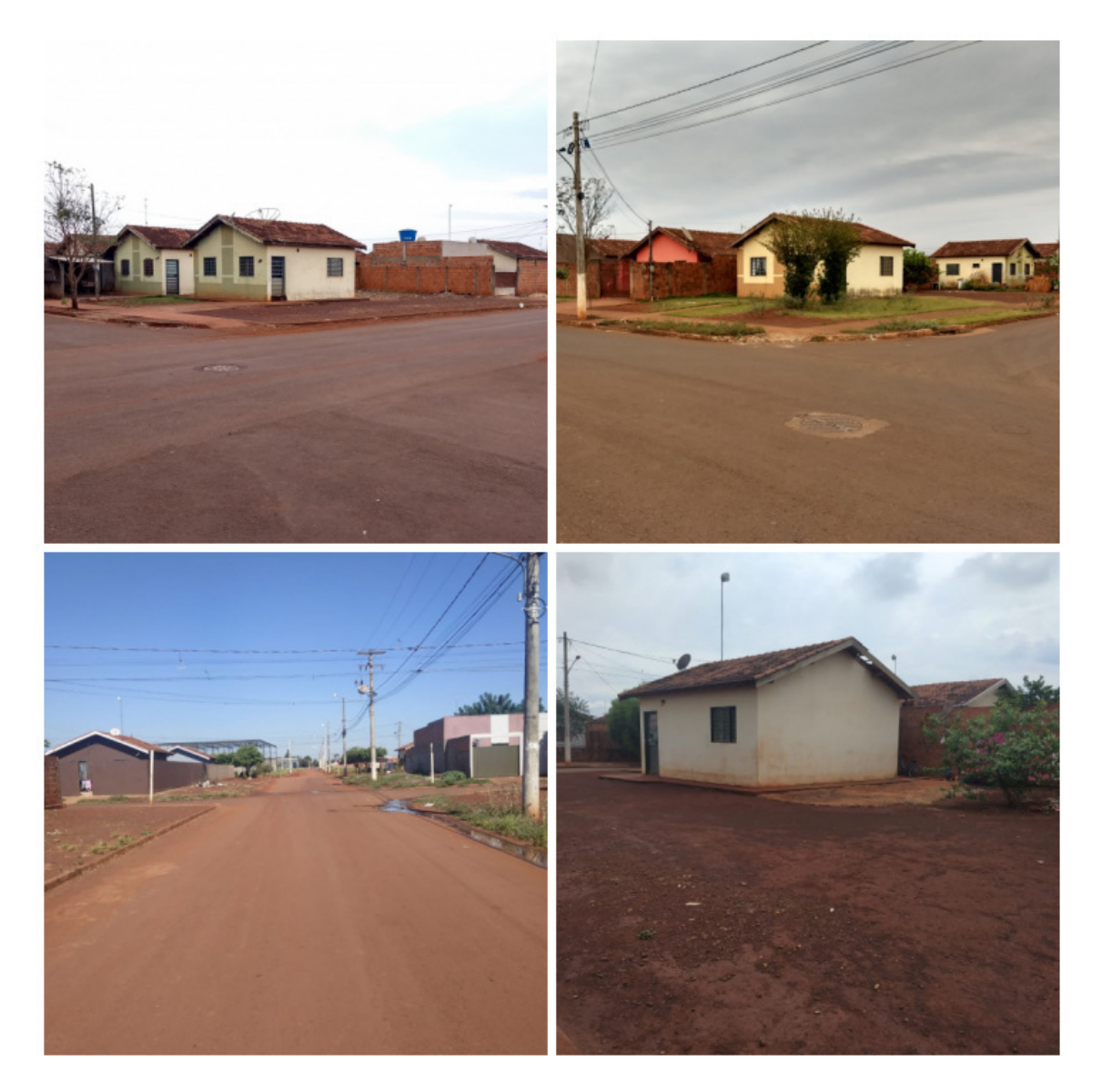
Figure 01 - Dourados-MS: PMCMV Enterprises Strip 1.

Subsequently, housing developments under the Programa Minha Casa Minha Vida (PMCMV, My House, My Life Program) significantly impacted the production of the urban periphery, especially in the southeastern section of the city, where the buildings of Strip 1 of the Program were set up in a more concentrated manner - Figure 01. Its location interferes with the spatial practices of thousands of poor residents of Dourados, whose access to the central part of the city, for example, is much more difficult, enhancing the weakening of centrality and the consequent loss of the ability to promote meetings.