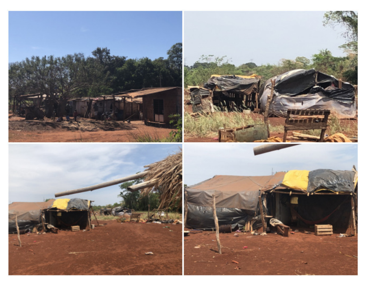
Figure 05 - Dourados-MS: Areas of indigenous repossession that surround the urban perimeter.

The distancing revealed daily also gives rise to a process of construction for those who do not live within walls, especially the indigenous people, or the stranger, the unwanted, or the "other". As Legroux (2021, p. 239) puts it: "Fragmentation thus expresses an intensification and a complexification of different processes, some older, others more recent."