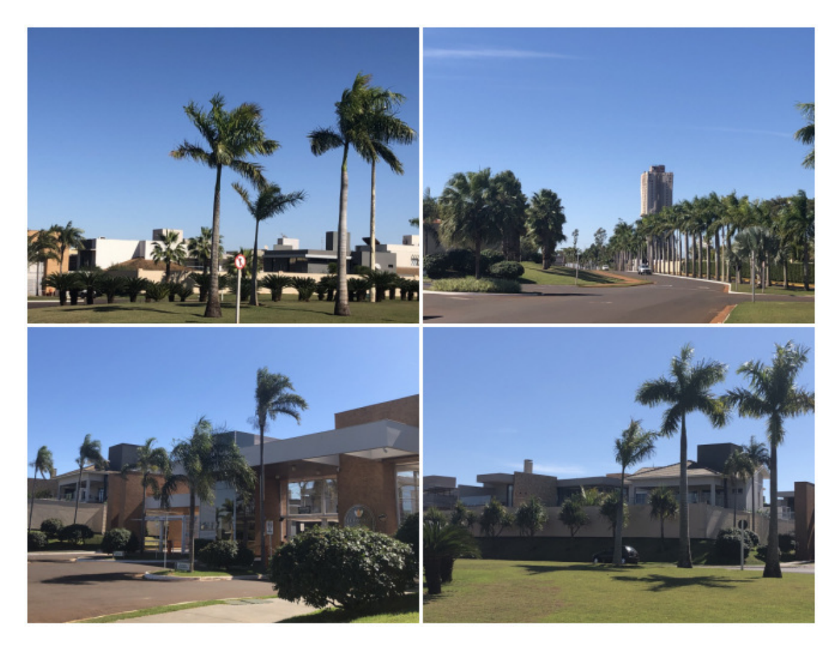
Figure 02 - Dourados-MS: Surrounding of the gated community Ecoville Residence I and II. Photo: The author (2020).

implementation of these projects changes the content of the suburbs and deepens the process of segregation, making the city's new dynamics and production logics more complex, which are no longer acknowledged only from the center-periphery relationship.