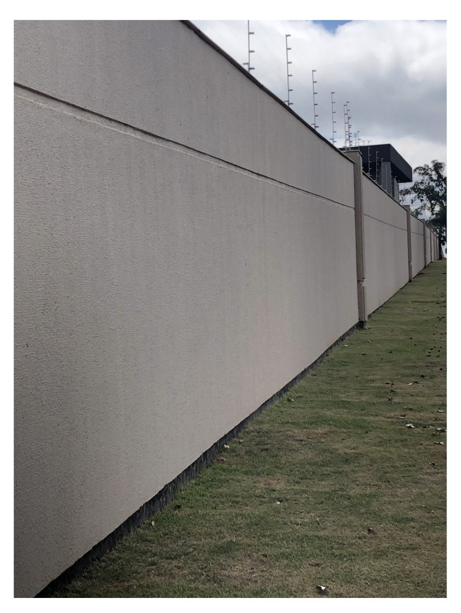
Figure 04 - Dourados-MS: Ecoville Residence gated community wall. Photo: The author (2020)

Commenting on this proximity, one of the brokers of the Hectares closed allotment asserted that it would not be possible for any indigenous person to "enter there drunk. They will not enter. They cannot. If they come in, they will be contained quickly. They are investing a lot in the security team, because the people who will come here are very concerned about security. They value security a lot."<sup>14</sup> This reveals, as Sposito points out (2019a, p. 18-19), a change in the nature of socio-spatial distance, "which is no longer measured only metrically, but is also the result of new forms of separation, both objective and physical (such as walls) and subjective (control and surveillance systems that generate intimidation and social hierarchy)", which enhances the deepening of inequalities.