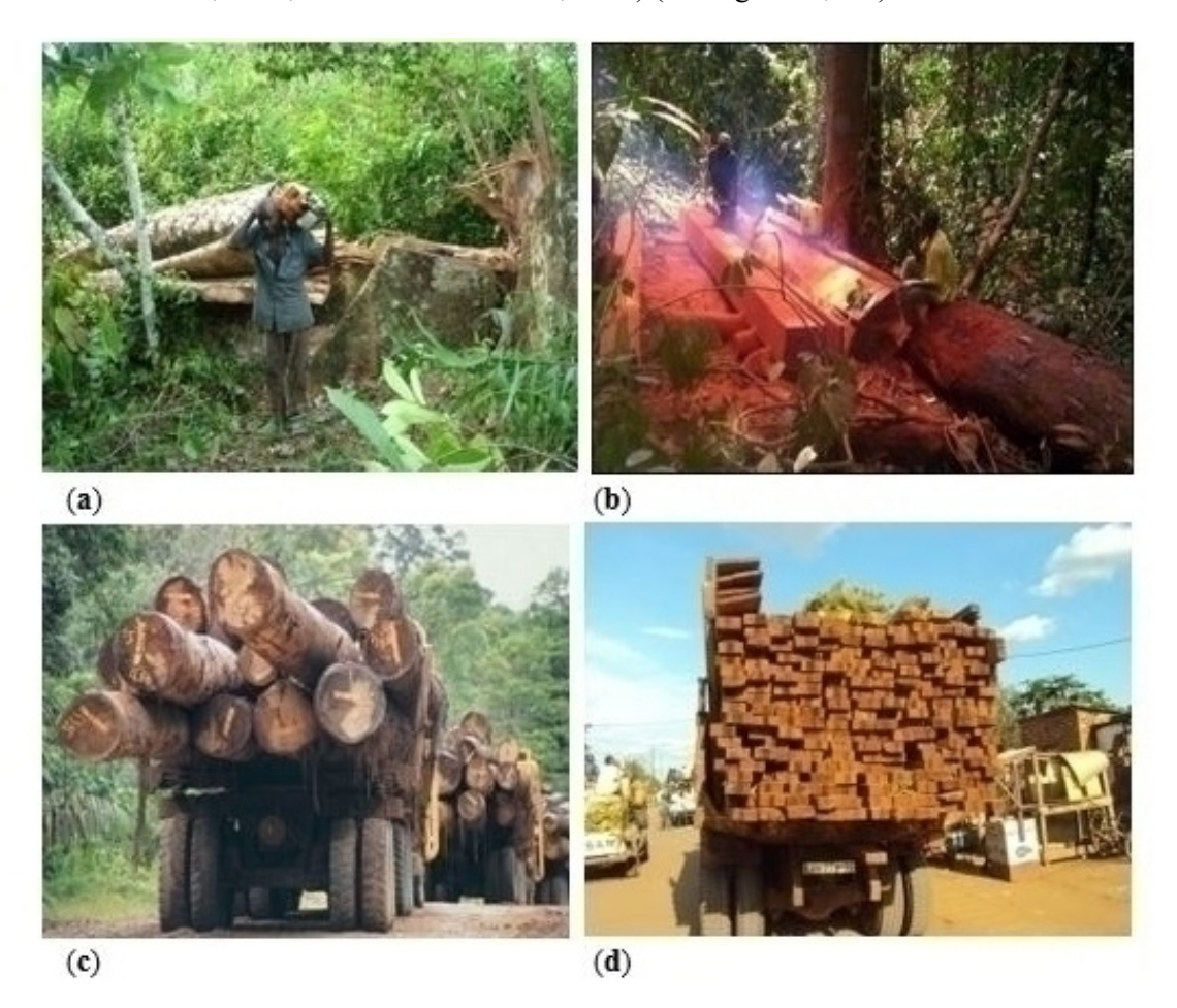
Figure 1 - Figure 1. (a) Illegal harvest of wood products in South-west Nigeria. (b) Illegal harvest (sawn into regular sizes for easy carriage) of wood products in South-west Nigeria. (c) Trucks transporting illegally harvested wood products to the capital city of Bangui in the Central African Republic (CAR) (ALMOND et all, 2020). (d) The illegally harvested wood products are now ready to be taken to the carpenters for further action (SHAFFER, 2020; ALMOND et all, 2020).

community forests, plus individuals with plantations, approximately five hundred harvesters, ten exploitation permit-holding small-scale enterprises, and approximately five exporting enterprises (INGRAM et all, 2007). Although commercialized NWFPs could provide money and jobs for the local population, they face the same difficulties as wood fuel in terms of exploitative labour conditions and low collector returns. In some cases, this is due to illegal and indiscriminate harvesting, misuse, and abuse, while in others, it is due to collectors' absence of expertise and bargaining ability (SHACKLETON et all, 2010; CHIDUMAYO et all, 2010) (see Figures 1; a-d).