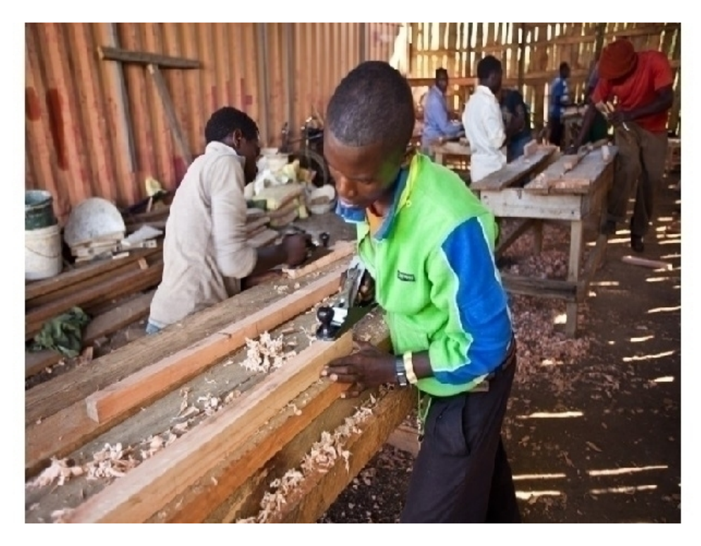
Figure 2 - Low skilled workers get trained in carpentry in a wood workshop in the WA Sub-region (FAO, 2006).

Fuel-wood use is anticipated to fall in absolute and per capita terms (POPOOLA et all, 2020). As living standards rise, this reflects a well-established and universal trend for more efficient and convenient fuels to replace fuelwood. With the decline in per capita GDP and the lack of alternative domestic fuels, this trend may not continue, and more people may be forced to rely on fuelwood in the future. This may be mitigated by Goal 8 of the SDGs, which focuses on cheap and sustainable energy. Poles, pilings, and posts are all used in construction. In terms of overall consumption, the continuous activities of low artisans trained in carpentry work have increased in the past two decades (see Figure 2), therefore the expected shift implies a minor rise by 2030 (FAO, 2006; SHAFFER, 2020].