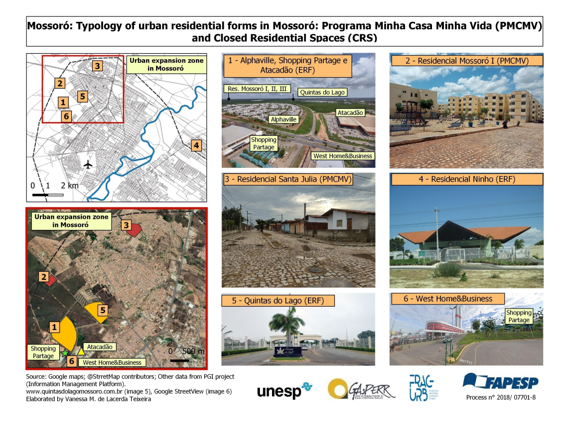
Figure 2- Mossoró: commercial spaces, services, and housing typologies.

The Partage shopping mall is located in the Nova Betânia neighborhood, considered a zone of expansion in the city. It has fostered a new form of consumption beyond the central area in an ongoing process of multiplication of central areas or multicentrality, thus, structuring a characteristic element of socio-spatial fragmentation and changing the former monocentric pattern (SPOSITO, 2007; WHITAKER, 2017) or even traditional centralities (SPOSITO; GÓES, 2013).